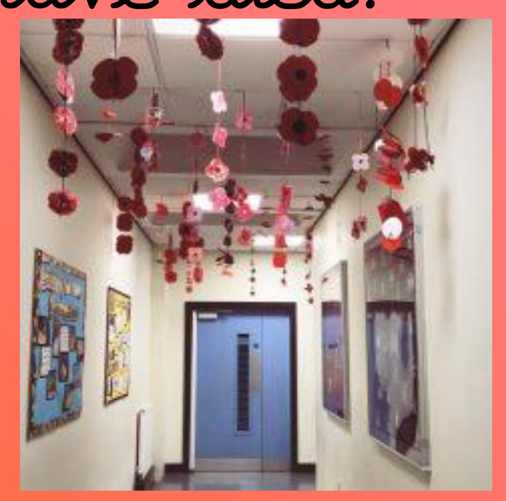
Making Poppy Mobiles