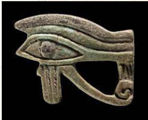
Eye of Horus