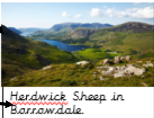
Herdwick Sheep in Borrowdale.

Living in the Lake District Despite being the largest National Park, only around 41,000 people live in the Lake District. Most of them rely on tourism to make money by running hotels and cafes.