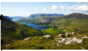
Herdwick Sheep in Borrowdale.