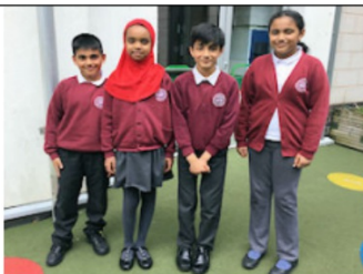
Arden Primary School

All pupils wear the outer blue coat, breeches (boys), pleated skirts (girls), white shirt with 'bands', yellow socks (for all boys and junior girls) and leather belts.