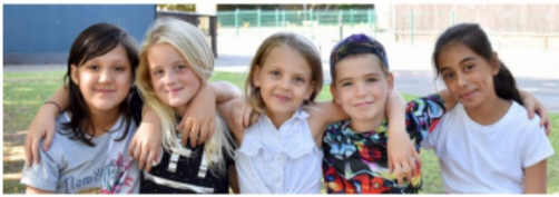
Larkrise Primary School

There is no specified school uniform but there is a dress code. Children should be comfortable, neat and tidy in appearance.