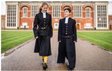
Christ's Hospital School

There is no specified school uniform but there is a dress code. Children should be comfortable, neat and tidy in appearance.