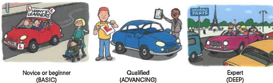
Novice or beginner (BASIC)

Think of Mastery being like the process of driving a car.