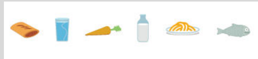
New School Food Standards