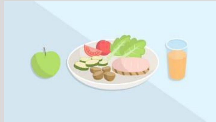
Universal Infant Free School Meals